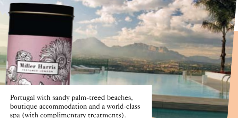
SHA, Alicante, Spain