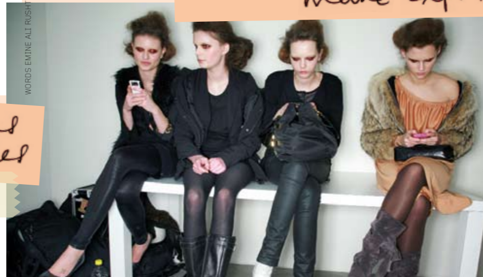
WORDS EMINE ALI RUSHTON

Leading the charge are the honesty-is-the-best-policy plugging British Beauty Blogger ( britishbeautyblogger.blogspot.com ) and Miss Malcontent ( missmalcontent.blogspot.com ). But nothing beats the millions of online e-pinions at makeupalley.com , which is the Oracle of objective beauty advice. The British version www.makeupadviceforum.co.uk , offers less in the way of reader tried and testeds, but does a good line in how-tos. Bookmark them now or regret it later.